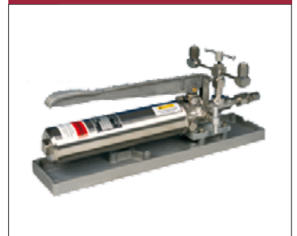
Pump System F