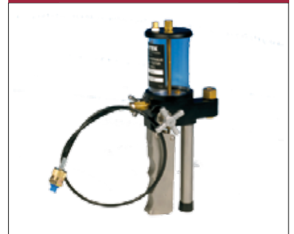
Pump System C