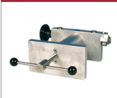
Pump System D