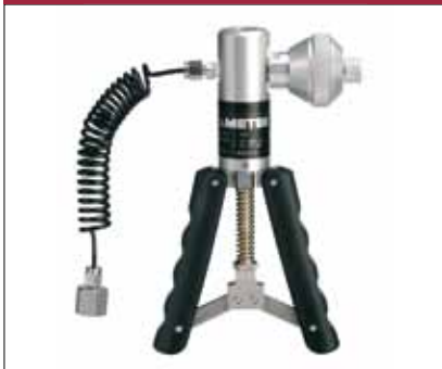
Pump System A

Our systems come in carrying cases with cut-outs for fittings, hose and the complete assembled calibration unit - no time required to assemble the unit before use!