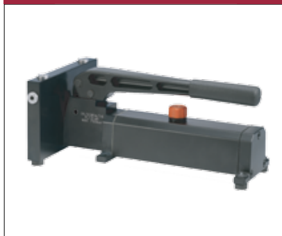
Pump System E