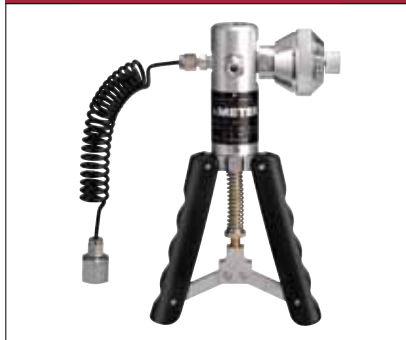
Pump System B